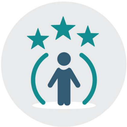
Better experience and outcomes for patients