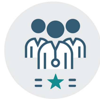
Better access to experts